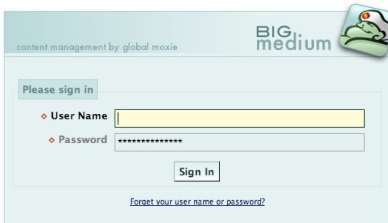
Figure 2.1. The sign-in screen